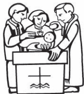
I baptize you in the name of the Father and of the Son and of the Holy Spirit